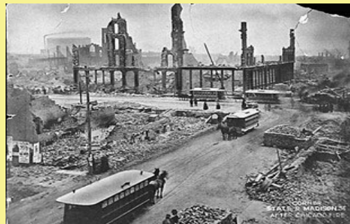
< Corner of State and Madison after the fire in 1871.